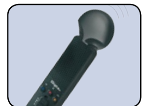
... and can be combined with RFID-/barcode reader